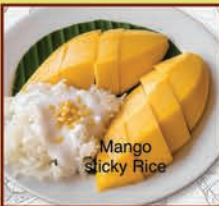
Mango Sticky Rice

BEEF • CHICKEN • SHRIMP • DUCK FROG LEGS • TALAPIA • CATFISH