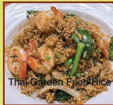
Thai Garden Fried Rice