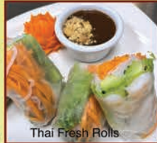
Thai Fresh Rolls