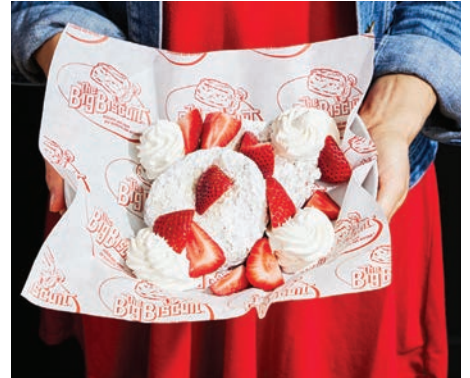
The Big Biscuit's new Strawberry Shortcake Bonut - buttermilk biscuits dipped in French toast batter, fried to golden brown perfection, then tossed in powdered sugar and topped with fresh strawberries and whipped cream.

Not only is the food mouthwatering, but The Big Biscuit just launched their Bigger, Better Beverage menu! They've added specialty drinks, including strawberry lemonade, iced teas, palmers, and cold brew with a creamy vanilla cold foam. Feeling adventurous? Dive into their five new Western Sodas, each blending coconut cream and lime for a refreshing summer twist. With so many options, The Big Biscuit's Bigger, Better Beverage menu offers a delightful, thirst-quenching experience for everyone.