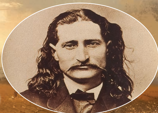
Wild Bill Hickok